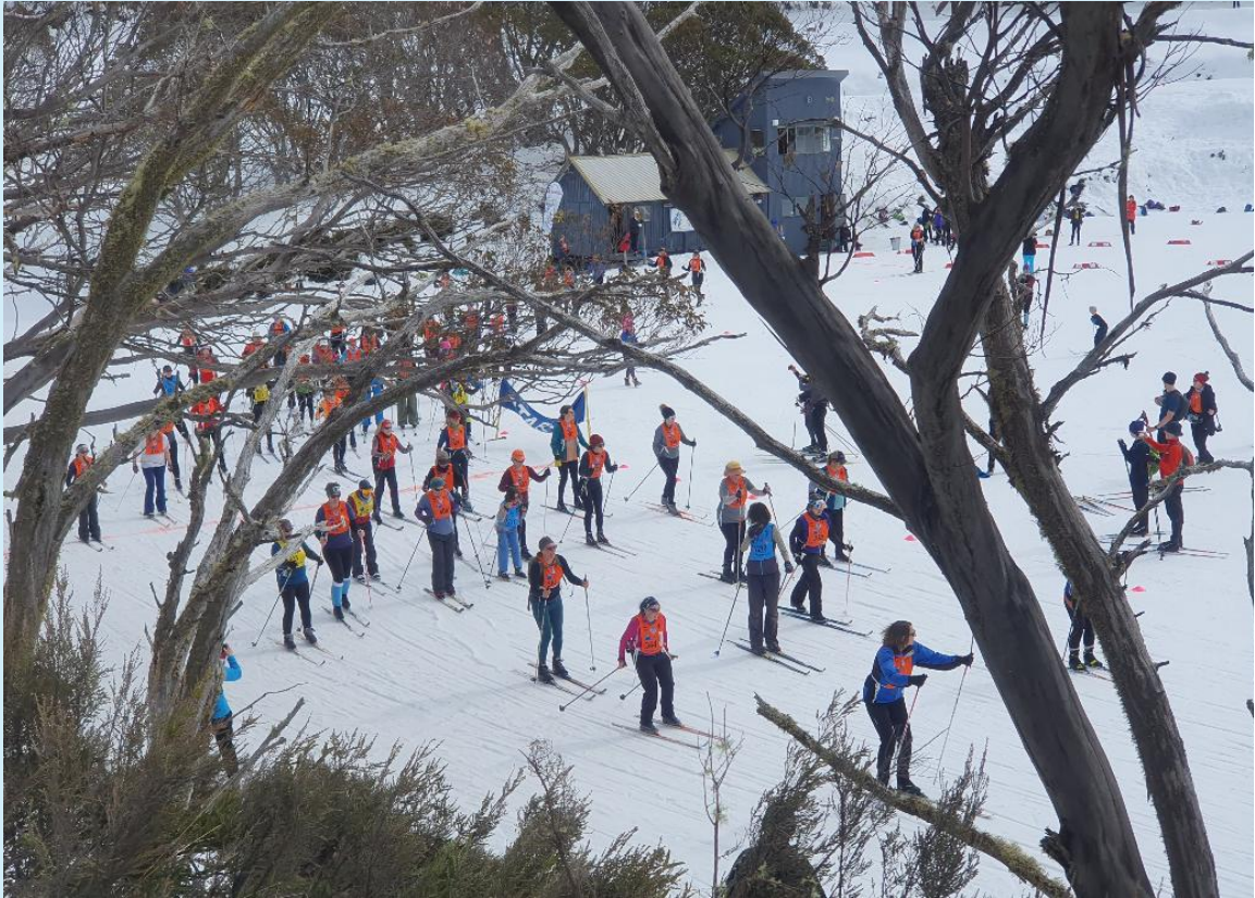
And they are off!