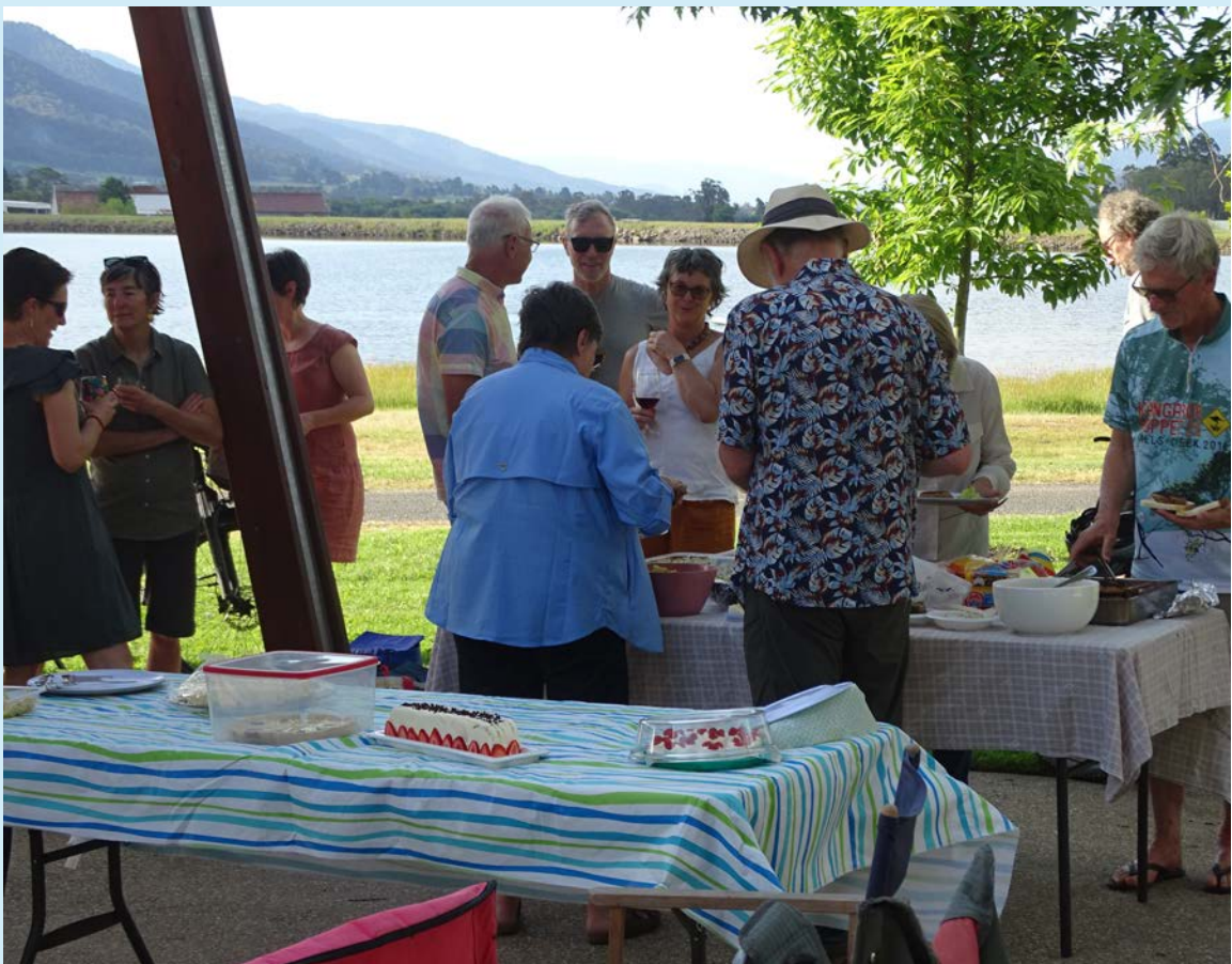
Folks enjoying a warm evening at end of season BBQ.

Further details will be provided once a date is set.