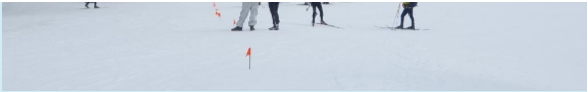
The start of the fun race at the 2024 Ski de Femme.