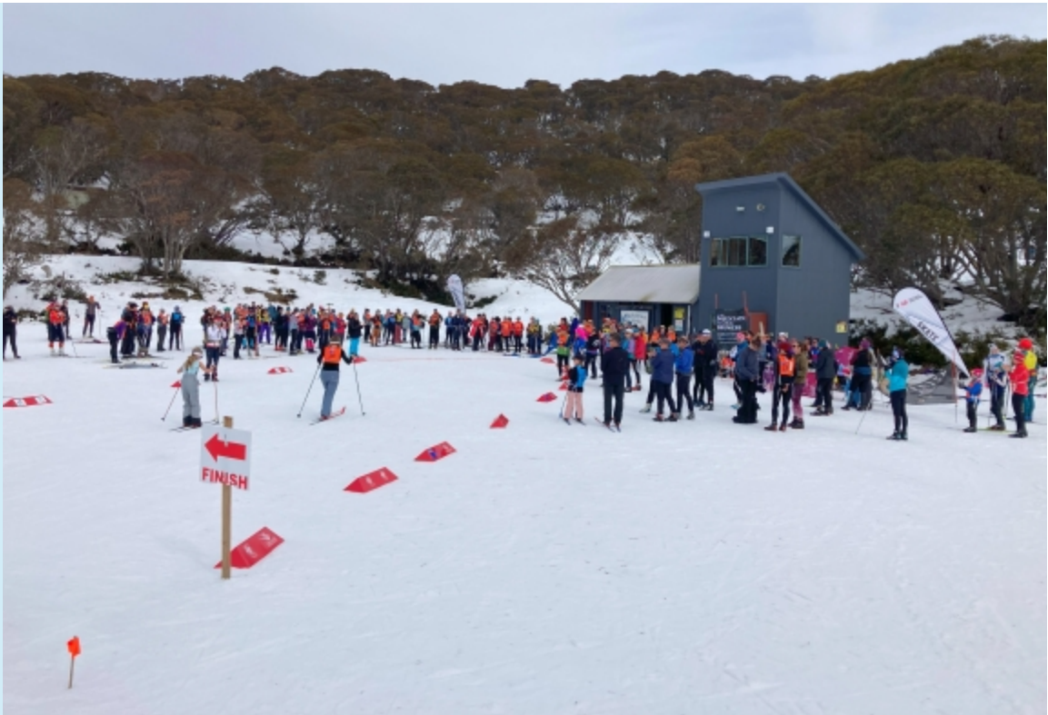
Coming into the finish of the fun race at the 2024 Ski de Femme.

Special thanks go to the major sponsors who donated some amazing prizes: Falls Creek Resort Management; The YMCA (Howmans Gap) & Falls Creek XC; Mountain Monk Brewers; Brazen Brownies; Mountain Sports Physio; and Silver Seed Jewellery.