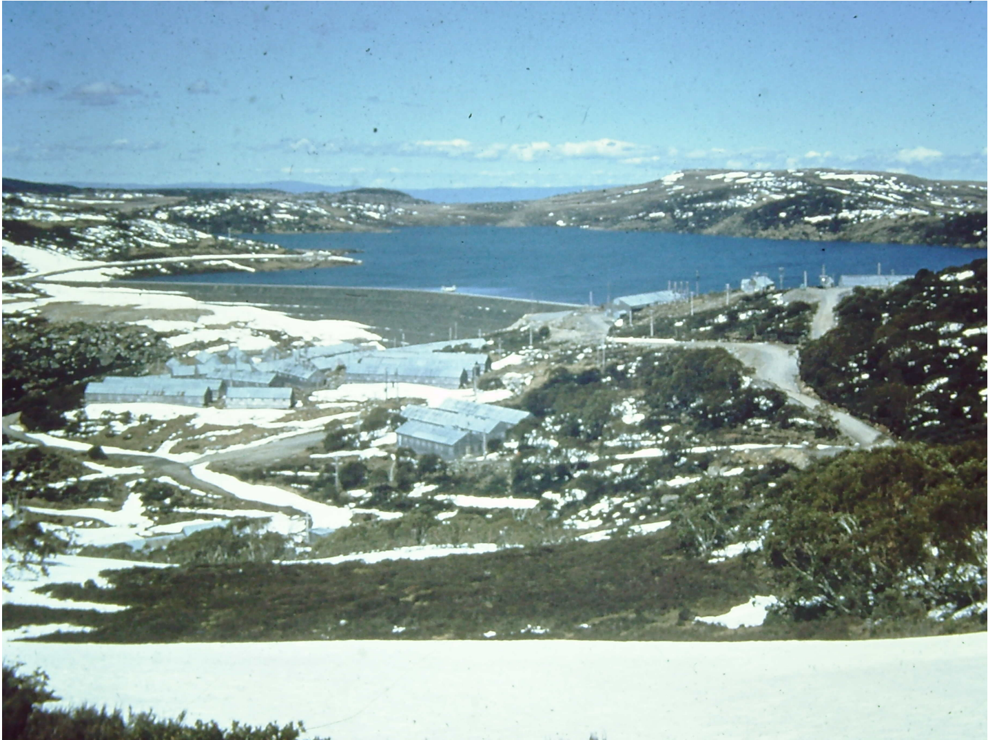
Paul L'Huillier sent me this photo of the Nordic Bowl, probably taken in the late 50s. A little different from today.