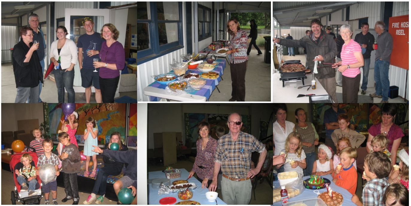
Assorted photos from the BBQ