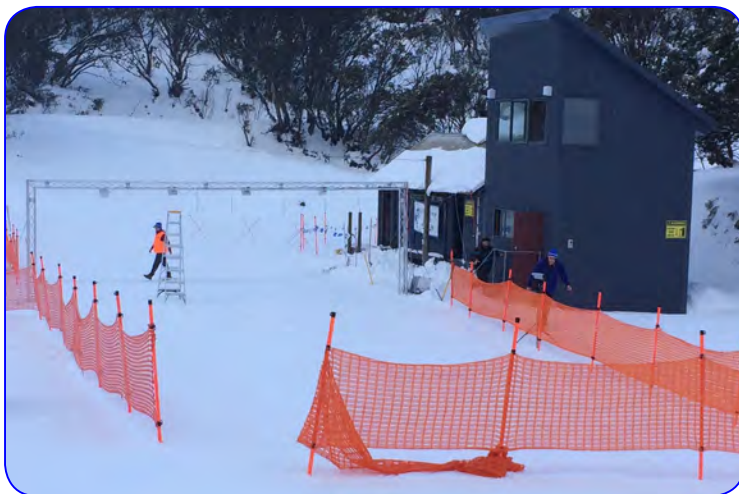
Birkie timing team finish line setup with timing gantry in place. All part of the preparation for the Club timing the Hoppet this year.